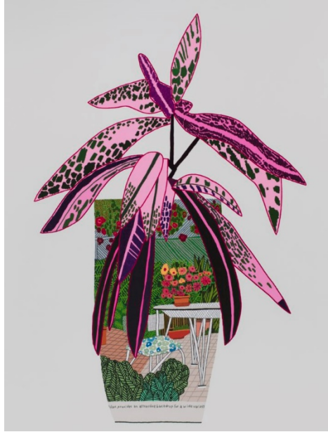
Jonas Wood Pink Plant Patio Landscape Pot 2016

Oil and acrylic on canvas 118 x 90 inches