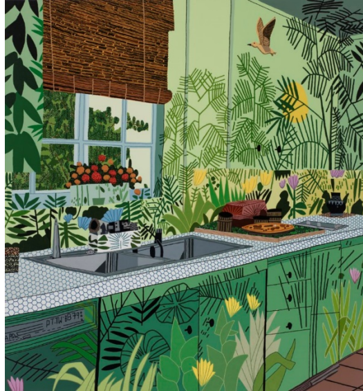
Jonas Wood Jungle Kitchen 2017 Oil and acrylic on canvas 100 x 93 inches

WW: When you're working on them, are you focused like that?