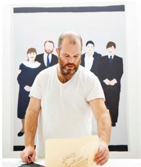
Portrait by Manfredi-Gioacchini.

WW: Is drawing for you, then, your way of working stuff out before the painting?