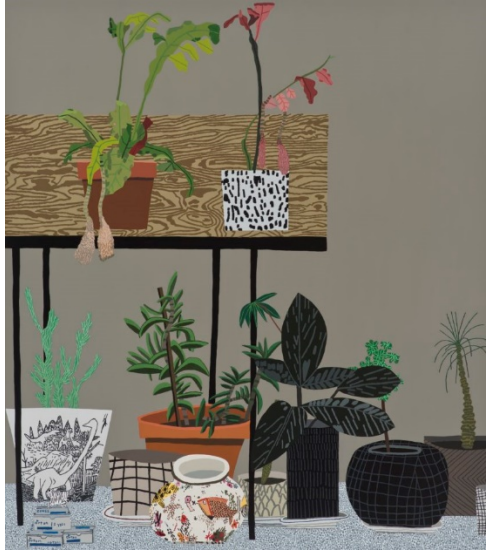
Jonas Wood Night Bloom Still Life 2013 Oil and acrylic on canvas 90 x 80 inches

WW: When she started introducing you to looking at pottery, what did you like about vessels? What made you want to paint them?