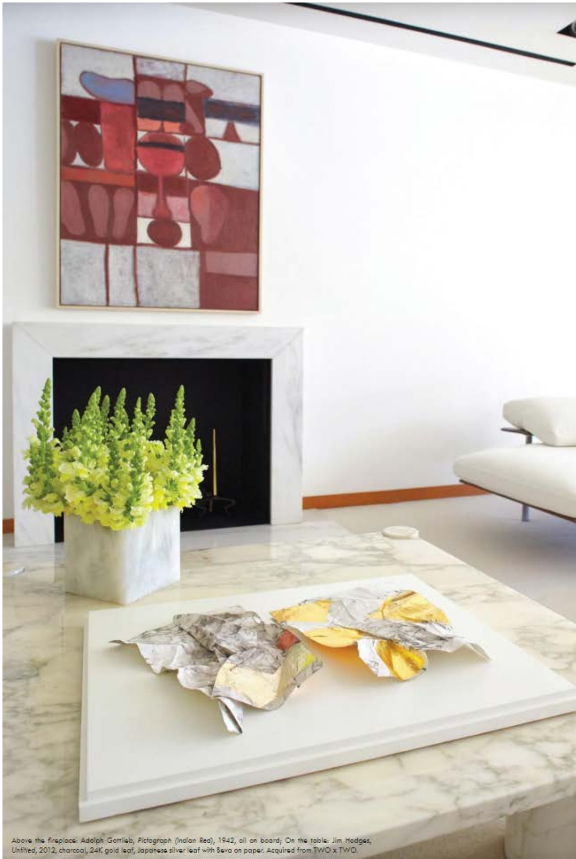
Above the fireplace: Adolph Gottlieb, Pictograph (Indian Red) , 1942, oil on board; On the table: Jim Hodges, Untitled , 2012, charcoal, 24K gold leaf, Japanese silver leaf with Beva on paper. Acquired from TWO x TWO.