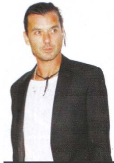
GAVIN ROSSDALE, COMMENTING ON THE RACHOFSKY HOUSE