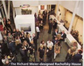
The Richard Meier-designed Rachofsky House