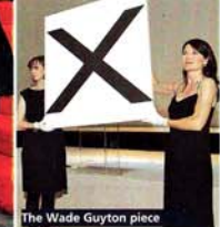
Stanley Tucci Kenneth Cole