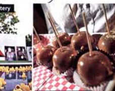
Candy apple goodies