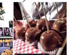
Candy apple goodies