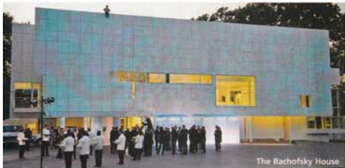
The Rachofsky House