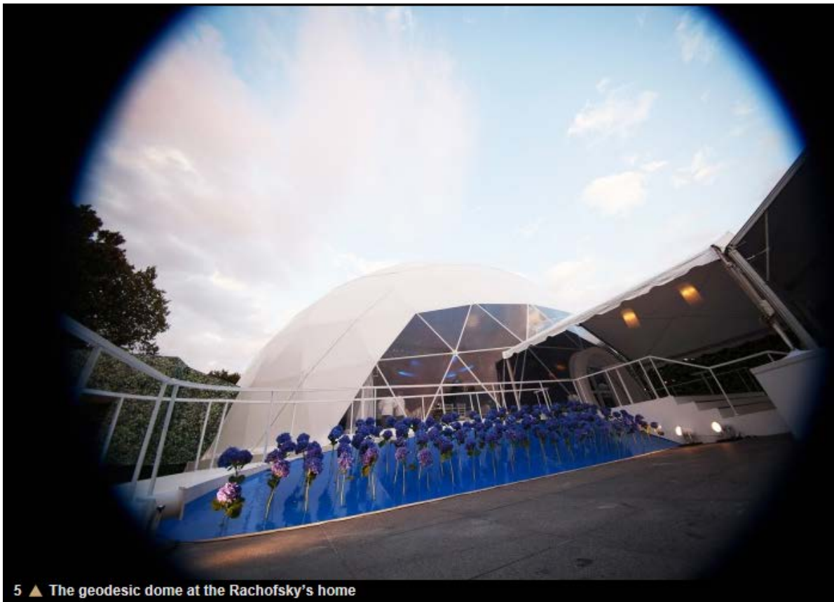
5 ▲ The geodesic dome at the Rachofsky's home