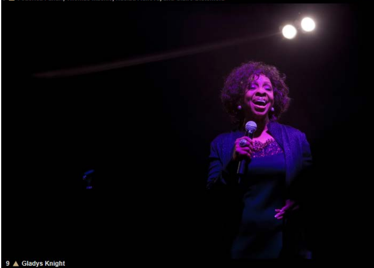
9 ▲ Gladys Knight