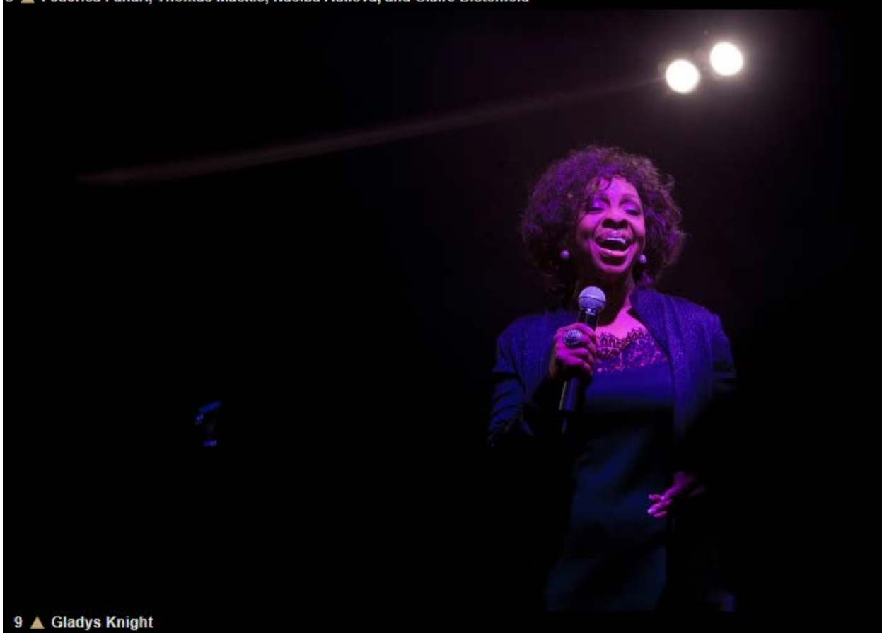
9 ▲ Gladys Knight