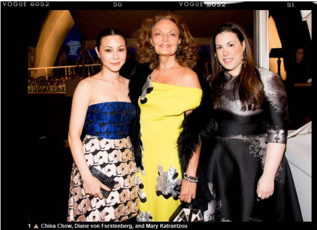
1 ▲ China Chow, Diane von Furstenberg, and Mary Katrantzou