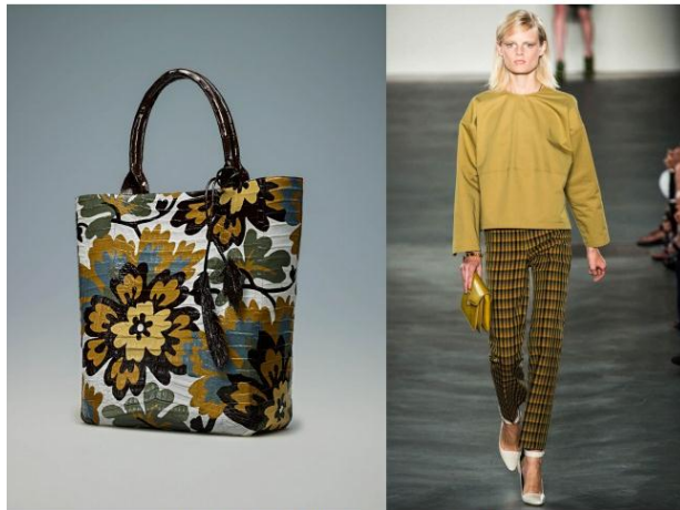
Mickalene Thomas x Nancy Gonzalez - SS13 Derek Lam